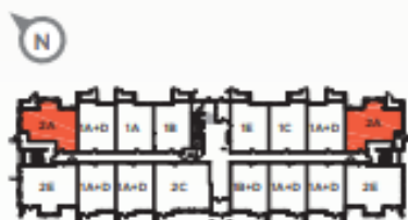
Residence 3 & 4 Ground Level